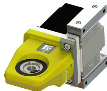
One Touch Holder